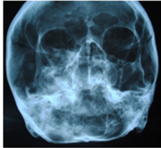
Figure 2 – Postmortem radiograph of the victim.

To perform the radiographic comparison between AM and PM radiographs, the skull of the deceased was positioned and radiographed in AP position with the mento-naso projection in order to obtain the PM radiograph (Figure 2). This allowed the analysis of the morphology of frontal sinus which presented the same anatomical characteristics.