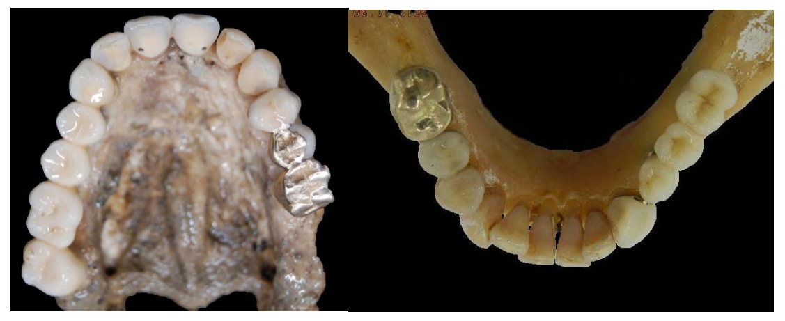
Figure 2- Maxilla and mandibular occlusal view.

Table 1 – Upper dental arch comparisons between the dental particularities evidenced in the ante-mortem (AM) records and in the post-mortem (PM) records (charts). Descriptions according Interpol dental codes<sup>8</sup> (Interpol, Lyon, France).