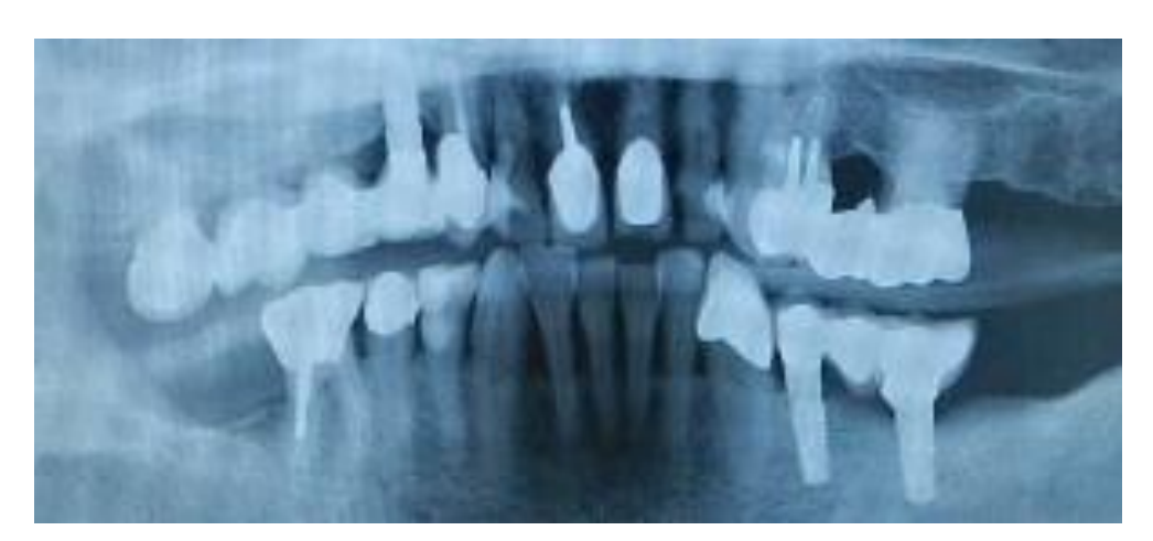
Figure 1- Panoramic x-ray incidence obtained from the upper and lower dental arches of the deceased ( postmortem ).

An overseas Police Bureau asked an investigation to Federal Police of Brazil and sent the dental records of a deceased. Dental arcs were cleaned and disarticulated (no enucleation technique was used because the body was skeletonized), and submitted to a panoramic dental X-ray (OPG) photographs. OPG and The postmortem were performed previously the knowledge of existence of the antemortem radiography and outside the Legal Medicine service.